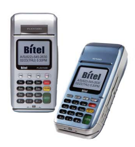
Our products are developed to fulfill the demand and needs in the secure payment and transactions market.