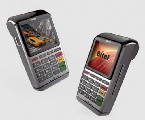
IC5200 Wireless EFT POS